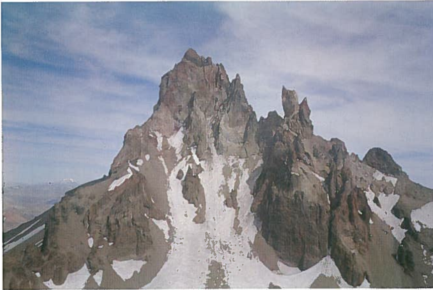
FIG. 3. East face of summit spire of Cerro Campanario, showing top 300 m of the fragmental core facies. Agglutinated pyroclastic deposits at right and left dip radially and steeply outward. Thin vertical dikes cut summit strata, which dip gently west, away from the viewer. Black scoria layer about 10 m below top is itself 8-10 m thick. Craggy gendarme 200 m ENE (right) of summit consists of agglutinated ejecta that dip steeply back (SW) into former crater, now erosively excavated.

representing lava-flow breccia, fallout from the more vigorous vent-clearing explosions, scoria falls, small sector-confined scoria flows, and remobilized slope debris. All the authors' evidence indicates subaerial eruptions, and they have observed none of the extensive hyaloclastites, slender-column entablatures, or subhorizontal columns typical of subglacial or englacial emplacement.