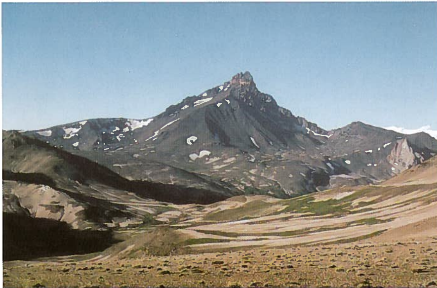
FIG. 2. View northeastward toward Cerro Campanario from 8 km southwest of the 3,943-m summit. Low sunlit divide near center of photo is 2,553 m Paso Pehuenche, crossed by the international highway. Extending toward viewer from the craggy stratified fragmental summit is a large black buttress 2,700-3,500 m in elevation that consists of SW-dipping mafic lava flows (site of our samples; Tables 1, 2; Fig. 1). Left and right skyline ridges (3255 m and 3424 m, respectively; see figure 1) are also radially dipping lava ramparts, glacially eroded, each consisting of 8-15 thin mafic lava flows. Lavas of the rampart at right are banked against remnants of an older mafic volcano, including pale crag that represents its shallow intrusive core. At left central edge of photo, middle ridge is part of Volcán Munizaga. In left foreground, lowest ridge consists of pyroxene-andesite lavas about 1 m.y. old (see LdM-255; Table 1). Foreground surface is glaciated plateau of similar (old) andesite lava flows, veneered discontinuously by reworked rhyolitic pumice that was originally deposited as subplinian fallout from postglacial eruptions at Laguna Cari Launa (Fig. 1) and Loma de los Espejos (6 km west of Fig. 1).

early Pleistocene or even Pliocene in age (González and Vergara, 1962), owing principally to its erosively degraded, skeletal condition (Fig. 2). The authors